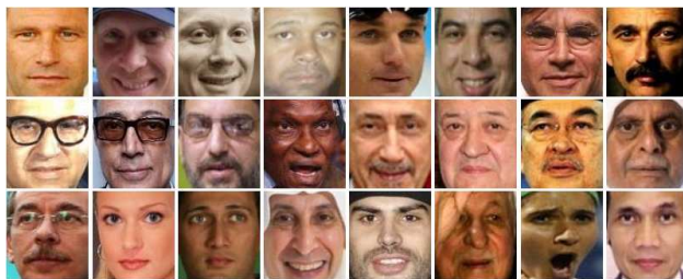
Fig. 2. Example images of our LFW dataset. The images are aligned by the centers of two eyes and the mouth, and resized to 104 \times 96 .

with an average length of 181.3 frames. Again, we follow the unrestricted with labeled outside data protocol and report the verification results on 5,000 video pairs. We crop and align the images according to the centers of two eyes and mouth as shown in Fig. 2, and we train the ResNet with the CASIA-Webface [22] database of 494,414 near-frontal faces from 10,575 subjects.